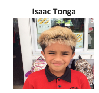
Favourite food: popcorn Favourite movie toy story Favourite drink: orange juice Favourite sport: soccer Favourite Part about Flat Bush school: Learning