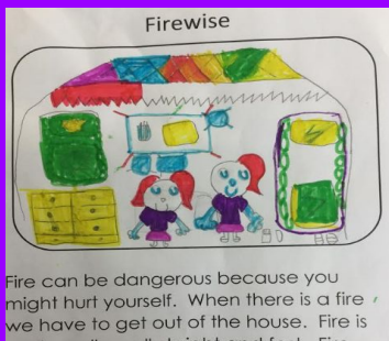
might hurt yourself. When there is a fire r we have to get out of the house. Fire is really really really bright and fast. Fire can come from pots, ovens, the sun and heaters. My best meeting spot is the mail box.